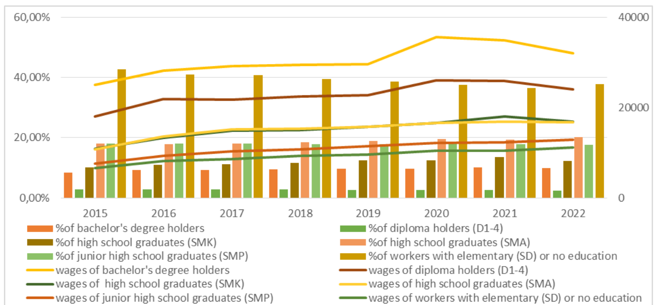
Figure 1. Average wage per hour (Rupiah/Hour) and workers with different levels of education (%) in Indonesia Source: Compiled by the authors based on the data from the labor section of Badan Pusat Statistik Indonesia. Retrieved from: https://www.bps.go.id/indicator/19/1175/1/upah-rata---rata-per-jam-pekerja-menurut-tingkat-pendidikan.html ; https://www.bps.go.id/statictable/2016/04/05/1909/penduduk-berumur-15-tahun-ke-atas-menurut-pendidikan-tertinggi-yang-ditamatkan-dan-jenis-kegiatan-selama-seminggu-yang-lalu-2008-2022.html (Date of access: 16 June 2023)

and well-educated labor. This phenomenon is observable in Indonesia as well, where education correlates with higher earnings (as illustrated in Figure 1). Figure 1 demonstrates that obtaining a university degree correlates with higher wages. In contrast, the earnings of those with only an elementary school education are approximately half the salary of university graduates. Theoretically, education levels show a positive correlation with income. Indonesia’s system of compulsory education comprises primary school (Sekolah Dasar – SD) (6 years), junior high school (Sekolah Menengah Pertama – SMP) (3 years), and high school divided in senior high school (Sekolah Menengah Atas – SMA) and vocational high school (Sekolah Menengah Kejuruan – SMK) (3 years). After completing compulsory education, students can enter an institution of higher education, which can be roughly divided into institutions of higher vocational education (Diploma 1 (D1), Diploma 2 (D2), Diploma 3 (D3), Diploma 4 (D4)) and those of academic education (bachelor, master, and doctoral degrees). However, after 2021, the salaries of high school graduates (SMA/SMK) have shown a slight decline, while those of people with primary school education (SD) and junior high school (SMP) levels have remained relatively stable. This shift has contributed to the evolution of Indonesia’s labor market dynamics.